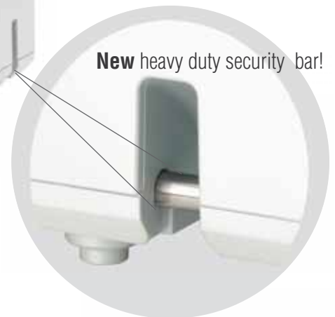
New heavy duty security bar!